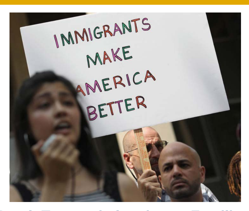
Part I: Trauma in Immigrant Families: Public Charge, DACA, and COVID-19 July 28, 2020, 12 – 2:30 p.m.